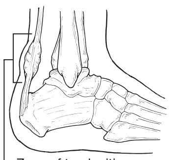
Zone of tendonitis or tendonosis

Achilles tendonitis is an inflammation of the Achilles tendon. This inflammation is typically short-lived. Over time the condition usually progresses to a degeneration of the tendon (Achilles tendonosis), in which the tendon loses its organized structure and is likely to develop microscopic tears. Sometimes the degeneration involves the site where the Achilles tendon attaches to the