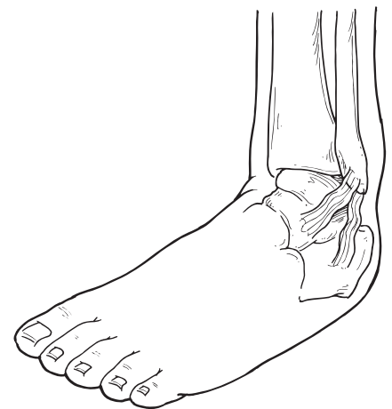
Injured ankle with laxity of ligaments

surgeon will ask you about any previous ankle injuries and instability. Then he or she will examine your ankle to check for tender areas, signs of swelling, and instability of your ankle as shown in the illustration. X-rays, CT scans, or MRIs may be helpful in further evaluating the ankle.